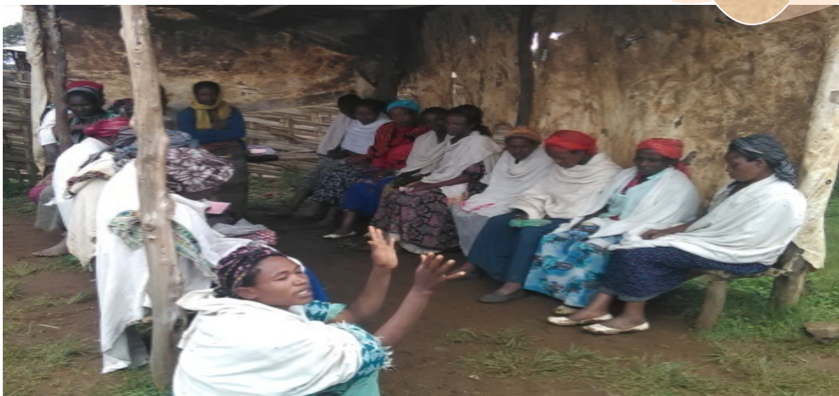
Women defining socio-cultural barriers for the low level of socio-economic status in their respective locality

"Over the days, my family's income increases, because I and my children work hard to escape from poverty. I can feed my children 3 times a day, I can send them to private school with full scholastic materials, dressed them well. Now I have an estimated of 14,000 ETB capital. Thanks all of you for your commitment and support. GOD BLESS ALL OF YOU"