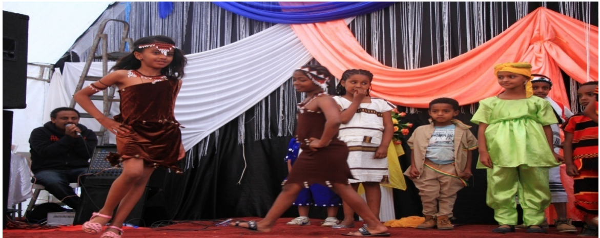
Children talent show