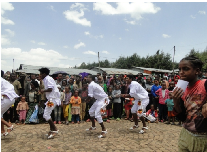
Community awareness creation through edutainment and recreational sessions about cervical cancer and its screening techniques