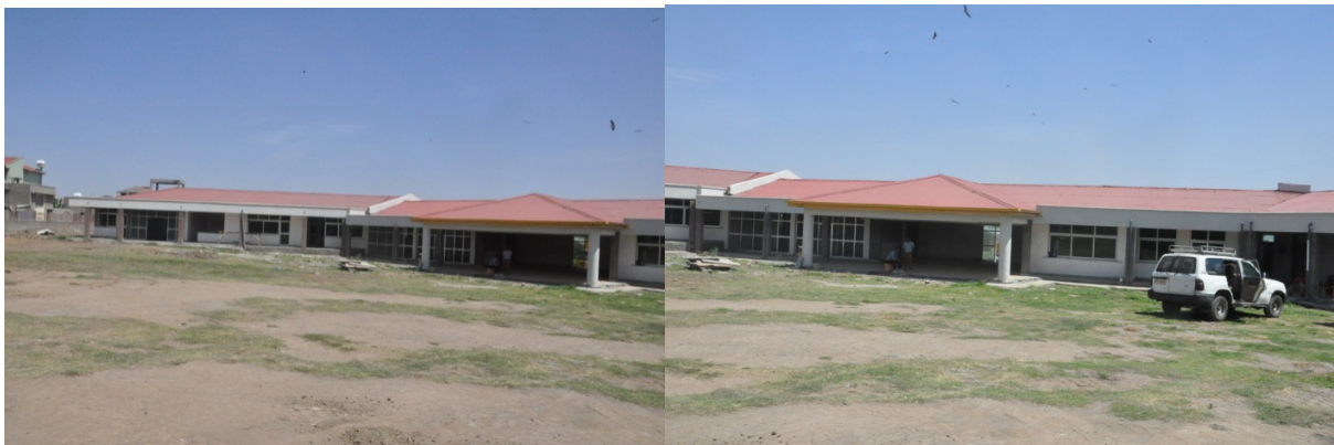
Front view of the center

been raised from Ethiopians in country and abroad.